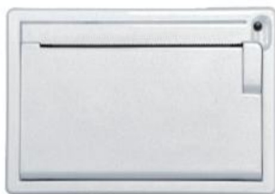
Built-in Thermal printer $150