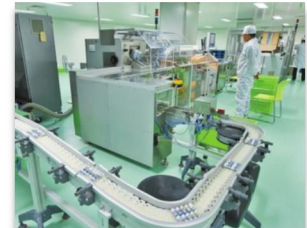
Scientific Research Center Bio-Technology Company